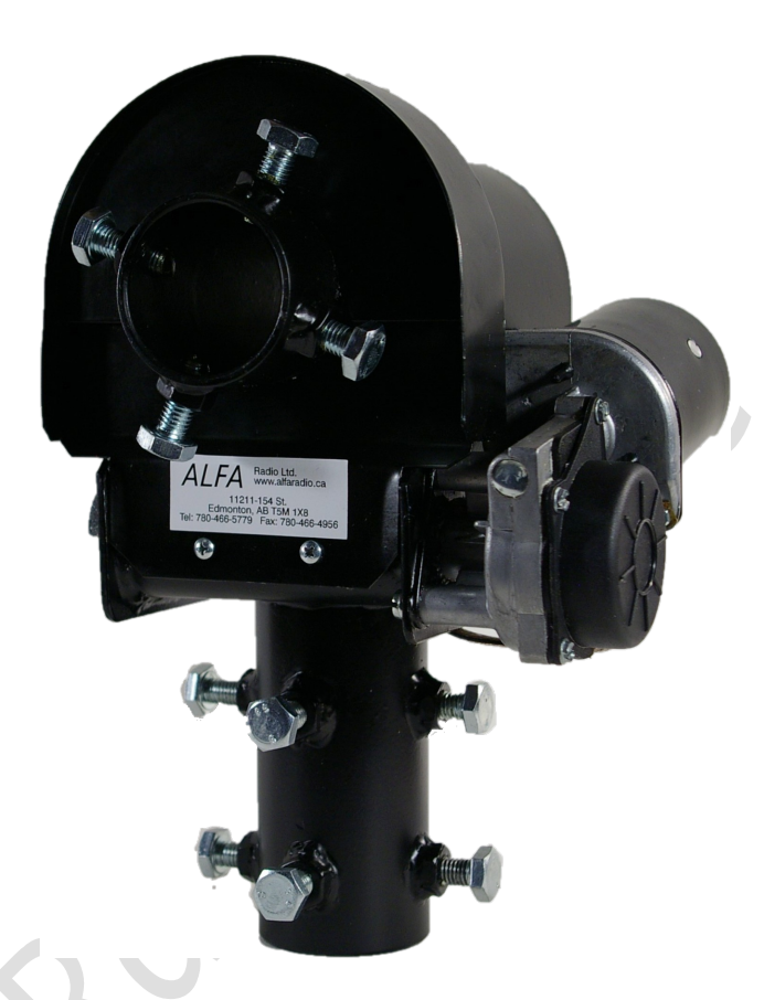
Revised 15 SEP 2022 http://www.alfaradio.ca

This manual is for use with units sold by Alfa Radio Ltd. of Edmonton, Alberta, Canada. on or after March 1, 2022. Units sold by others may have different firmware and may operate using different voltages.