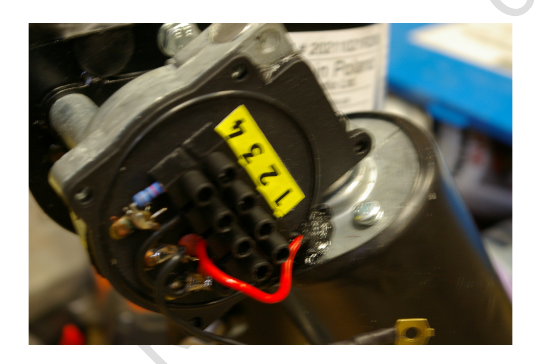
Step 2: Pull down the plastic carrier to expose the Reed Switch which can be seen next to the three copper studs on the left of the picture below.

Step 1: Remove the cover from the motor at the location where the control cable enters the Motor. The Terminal strip for connecting the control cable will be exposed.